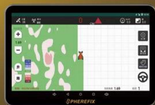
High-Precision Intelligent Display Tablet