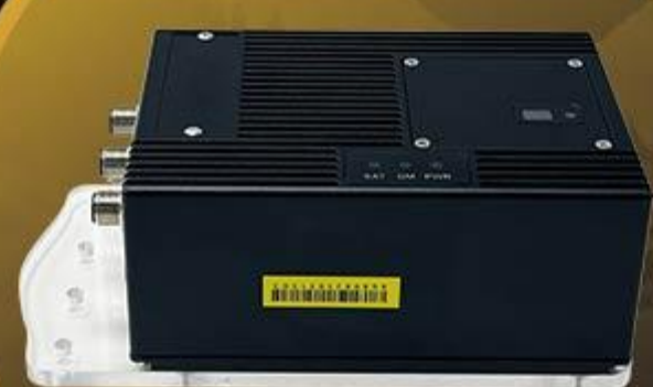
Electronic Control Unit